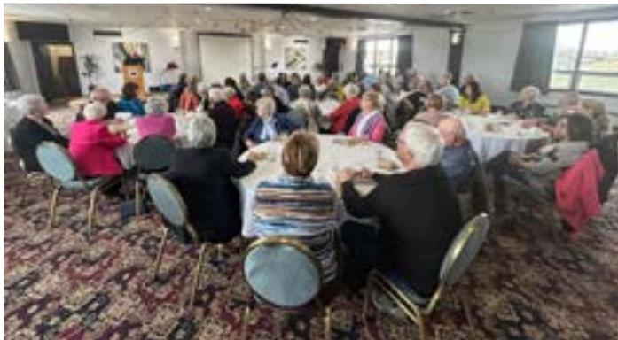
Members gather for the luncheon.

On January 6, 2024 we had our first Old Christmas Day get-together since COVID-19 at Sinbad's Hotel in Gander, with about 20 people in attendance. It was an excellent meal and we all enjoyed the camaraderie and friendship.