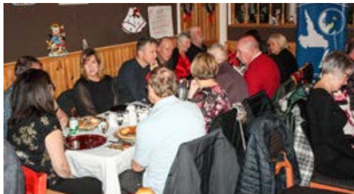
Bonavista Division Christmas Social