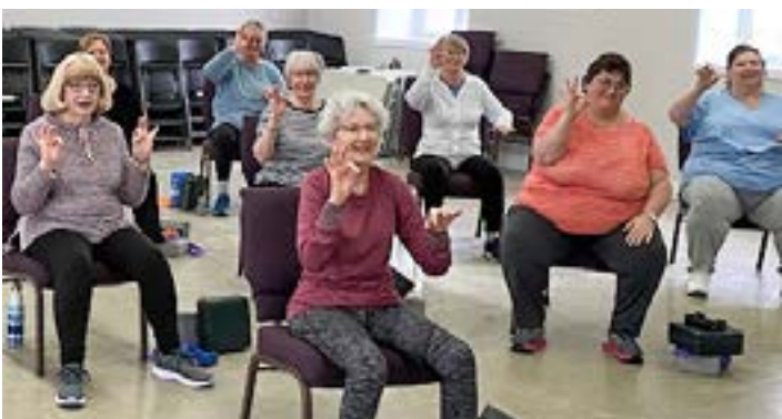
A movement therapy session in full swing.

Speaking of winter, our Christmas social was a resounding success. Over eighty people were served a delicious hot luncheon by the staff and volunteers of the Caribou Curling Club. After lunch, three of our retired teachers entertained us with music and song, and there was even a visit from some mummers!