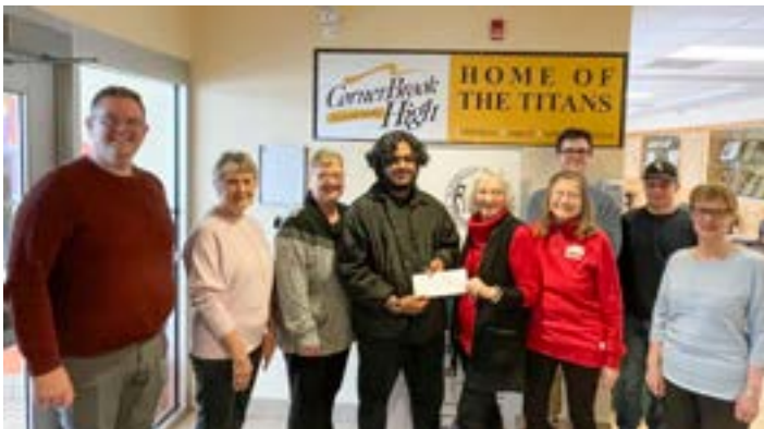
Members of Western Division present Corner Brook High School with a $300 donation.

24th by expressing disappointment that our Christmas Social had to be cancelled. Various reasons such as low numbers, timing with the annual Santa Claus Parade and the weather contributed to having to make this unfortunate decision. We proceeded to discuss a different approach for next year's event, so stay tuned!