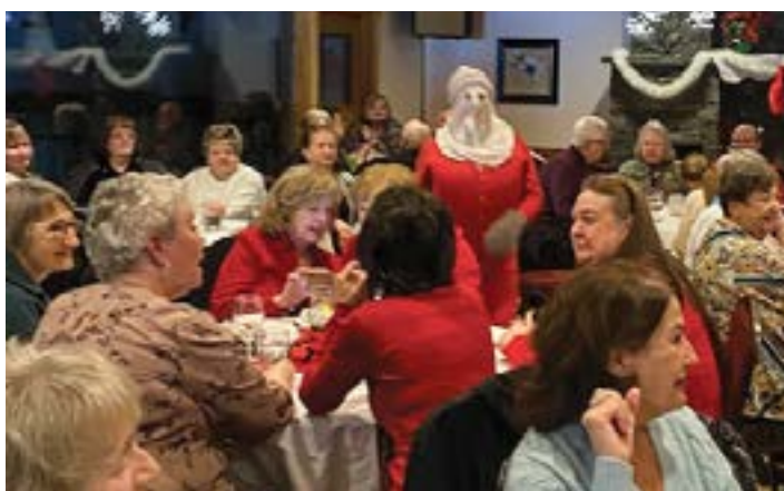
Stephenville Regional members gather for the Christmas Social.

Speaking of winter, our Christmas social was a resounding success. Over eighty people were served a delicious hot luncheon by the staff and volunteers of the Caribou Curling Club. After lunch, three of our retired teachers entertained us with music and song, and there was even a visit from some mummers!