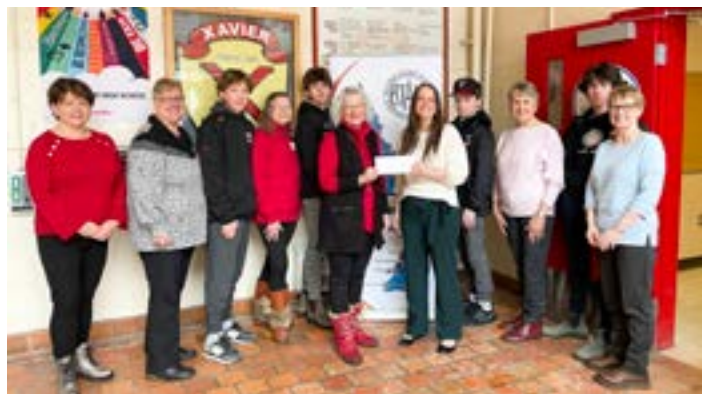
Members of Western Division present Xavier Junior High School with a $300 donation.

After a lengthy discussion on the breakfast program donations, Corner Brook High School and Deer Lake's Xavier Junior High School were the recipients of this year's breakfast program donation. Three hundred dollars ($300) was presented to each school on Valentine's Day.